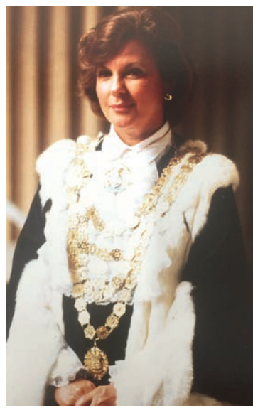
Brisbane's first female mayor.