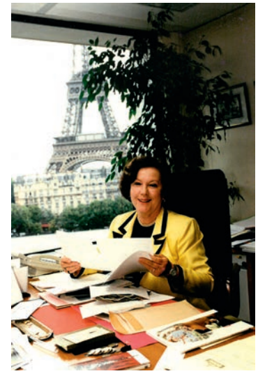
Office with a view in Paris.

"When I went into politics I never thought I'd be good enough for lord mayor but when I went in and started